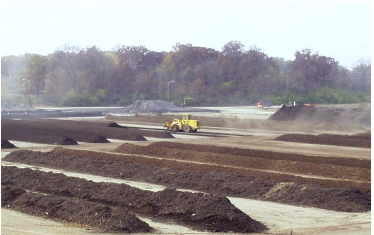
Purdue University's SoilerMaker Facility (October, 2000)

From our earliest field trials, our composting operation suffered significantly from odours problems that resulted from the decomposition of the bio solids. Our first facility was closed within six months due to odour complaints. We built a new facility further away from campus residences and modified our process but still suffered from odour complaints. In March of this year, we began experimenting with a commercial odour control product manufactured by Global Odour Control called BAT 506. This report describes the odour reduction and economic impact from using this product.